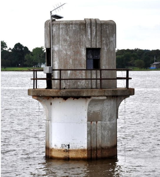
Lake #1 tower at 1071.75 on September 12, 2010.